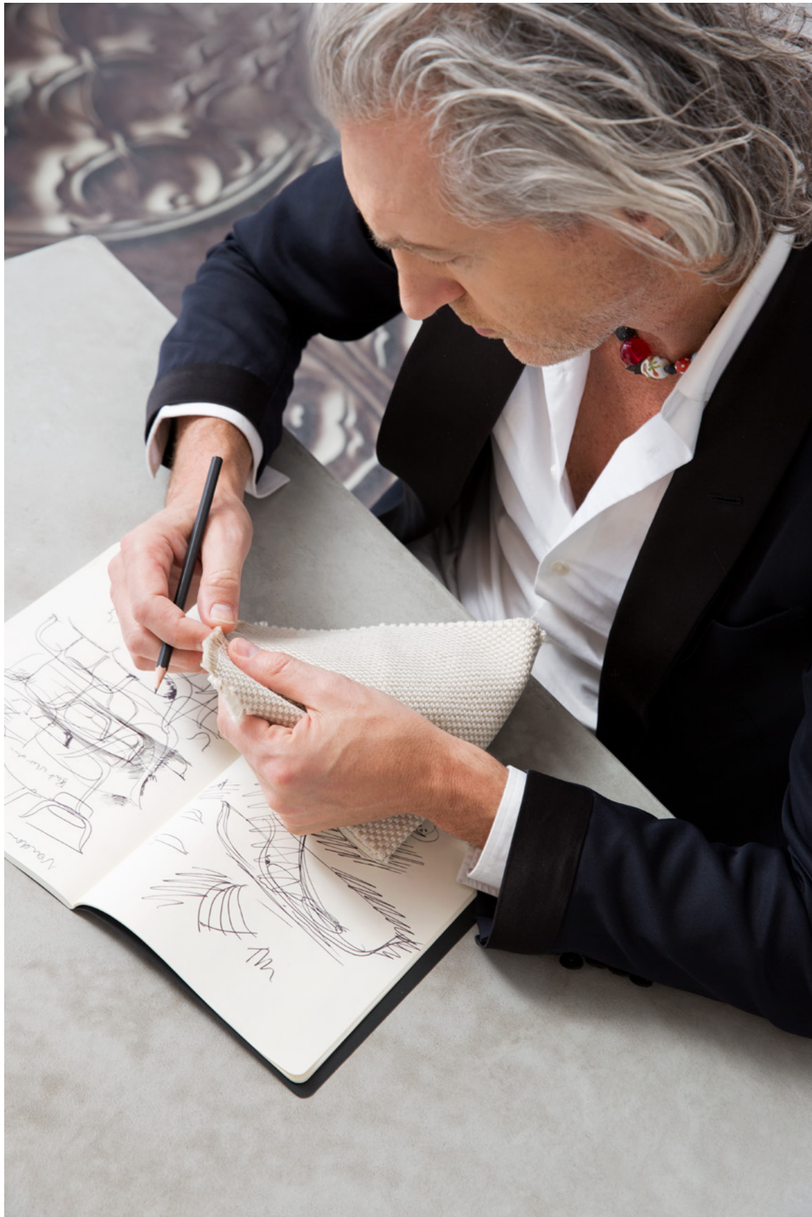
Marcel Wanders in his studio in Amsterdam, The Netherlands.